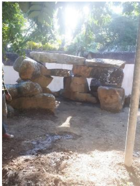
Photo above left indicates loose rock formation with under dig that was unsafe. The rock formation was removed, the hollow dug by bear filled with soilcrete and compacted, rocks placed and grouted – Photo above right.

In broad terms the following aspects to the bear enclosure should be addressed.