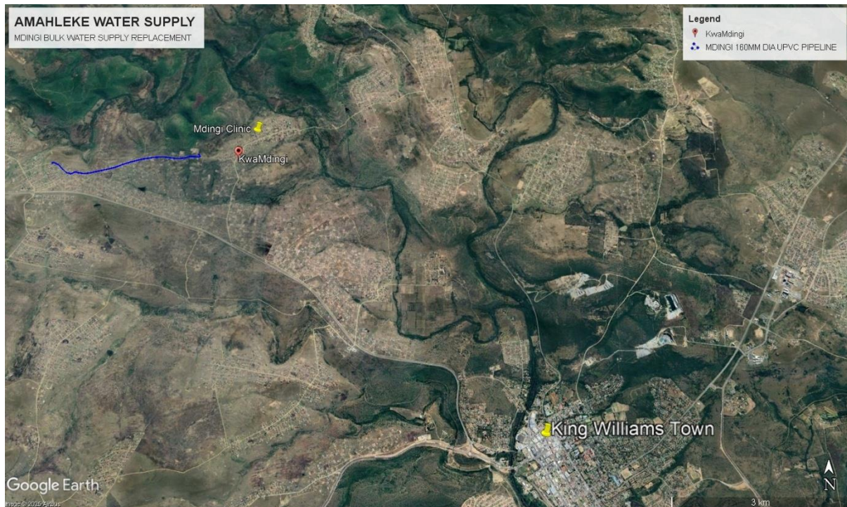
Figure 1 - Mdingi Pipeline Location

The project area is rural and situated in Mdingi village under the Amahleke water scheme, approximately 5 km from King Williams Town towards Dimbaza. Access to the project area is via R63. Notwithstanding the access to site as described above, the successful tenderer will be held to have satisfied himself /herself with the location of the sites.