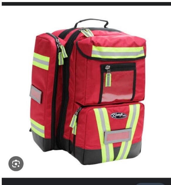
PHOTO AND DESCRIPTION OF A TRAUMA BAG