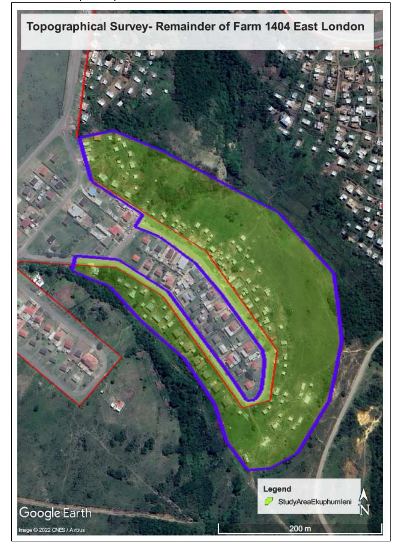
Annexure- "A"-Study Area Map