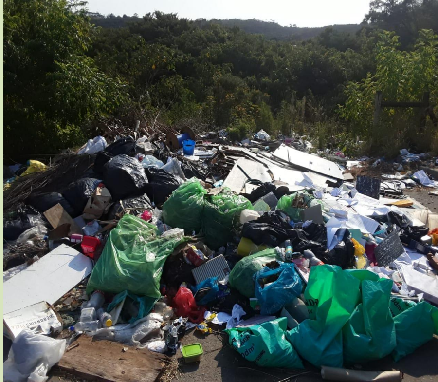
Edge Road in Beacon Bay