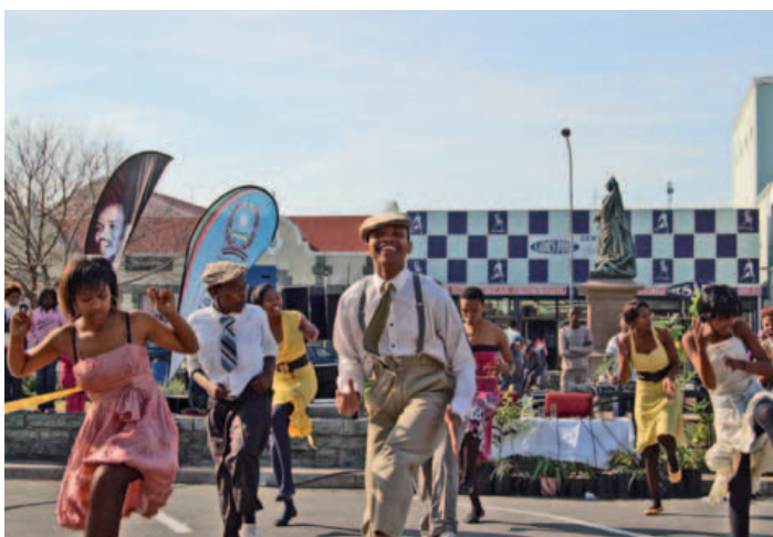
The Kingdom Youth Dance Group entertains at the closing ceremony of Youth Month in King William's Town.

There were performances by Brainstorm Hip Hop Movement, Belcanto Singers, Quad City Entertainment and Unicef-Score.