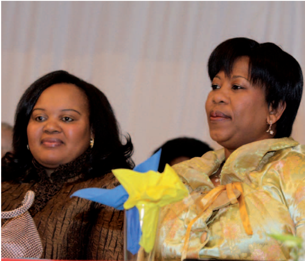
Gracing the Mayoral Inauguration: South Africa's First Lady Nompumelelo Ntuli-Zuma was part of the dignitaries from various sectors including government, business and political organisation that attended the State of the City Address and Mayoral Inauguration.

Tel: 043-722 1011 Physical Address: 50 Belgravia Crescent