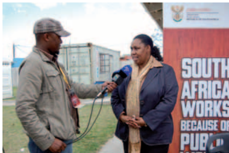
National Department of Public Works (DPW) Deputy Minister Hendrietta Bogopane Zulu is interviewed by SABC Television News Reporter Lumko Jimlango during the event.

(DPW) Hendrietta Bogopane-Zulu, who is also former CRMA adviser on disability programmes, Eastern Cape Premier Noxolo