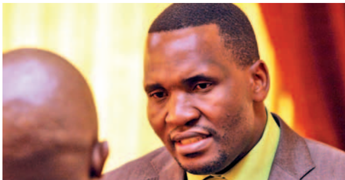
Corporate Governance & Traditional Affairs Minister Sicelo Shiceka in his address urged Local Government to address public perceptions of its performance.

and shall issue progress reports for consideration by the 2010 National Members Assembly.