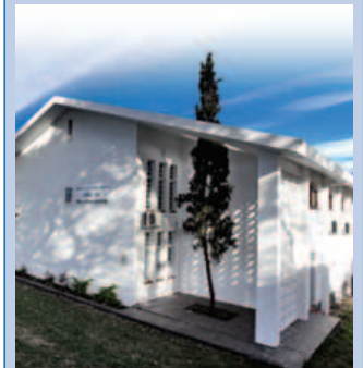
Buffalo City's Wellness Centre in Number 50 Belgravia Road