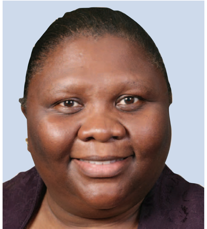
Eastern Cape Premier Noxolo Kiviet