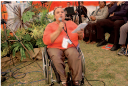
Buffalo City Municipality Centre for Municipal Research and Advice (CMRA) and the Netherlands embassy were thanked by members from various organisations catering for the needs of people with disabilities.

The Clinic has been renovated to ensure proper access to all patients including wheelchairs and the deaf. Other clinics renovated are in Berlin and Cambridge.