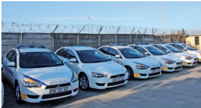
BCM traffic and law enforcement have 12 new cars to beef-up its crime-fighting arsenal based in East London.

“keeping the city’s roads safe for citizens and visitors”