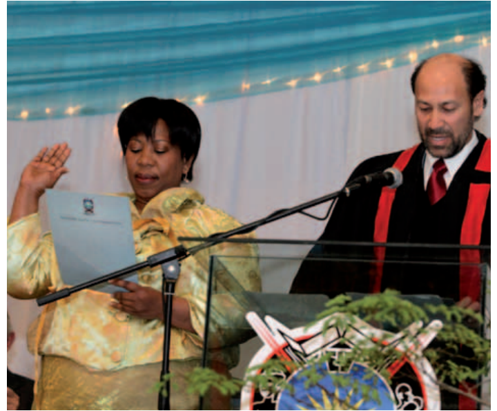
Madam Mayor: Magistrate Nazeem Joemath officiates the taking of oath and thereafter declares the Executive Mayor Zukisa Faku as the City's first Citizen.