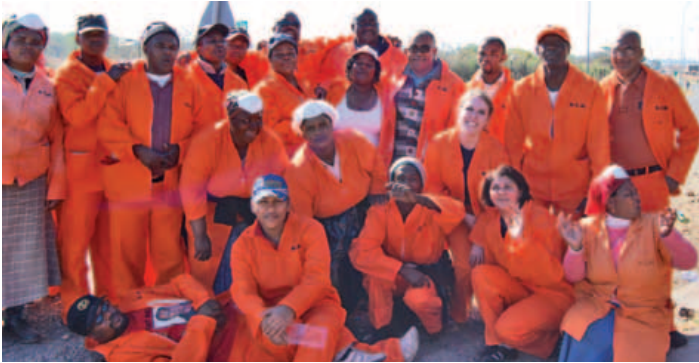
BCM honours Mandela Day: South African citizen in all walks of life heeded the call to honour tata Nelson Mandela by embarking in community service giving exercises in a remarkable demonstration of ubuntu and the renowned Madiba spirit. In this Picture City's leadership, officials involved in Duncan Village clean up.