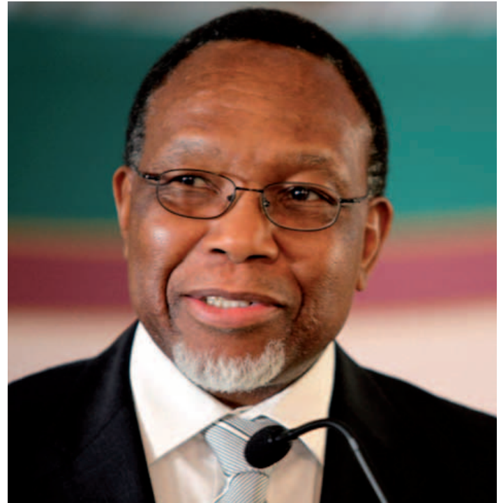
Deputy President of Republic of South Africa Kgalema Motlanthe delivers a keynote address at SALGA National Members' Assembly imbizo (NMA) which took place at East London's Premier Regent Hotel.

"We make this DECLARATION as the leadership of local government for the Republic of South Africa and all our people to know that we, as municipalities and organised local government, intend to do everything in our power to realize our common goals and ensure a better quality of life for all our people, we affirm our full support for these common objectives and our collective resolve to achieve them."