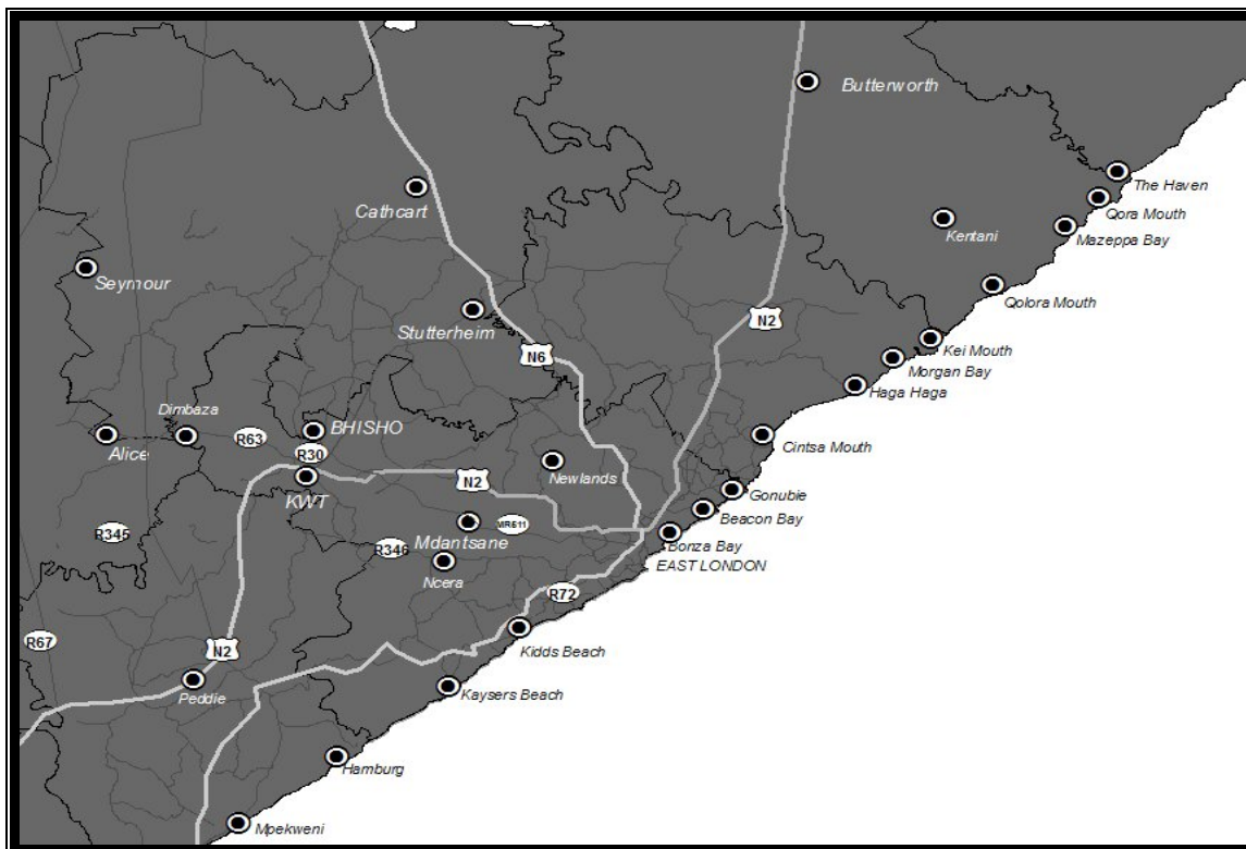
Figure B.1: BCM Boundaries and Key Urban Centres

Buffalo City is the key urban centre of the eastern part of the Eastern Cape. It consists of a corridor of urban areas, stretching from the port city of East London to the east, through to Mdantsane and reaching Dimbaza in the west. East London is the primary node, whilst the King Williams Town (KWT) area is the secondary node. It also contains a wide band of rural areas on either side of the urban corridor. (See Figure B.1 below). Buffalo City's land area is approximately 2,515 km 2 , with 68km of coastline.