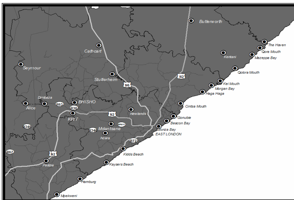
Figure B.1: BCM Boundaries and Key Urban Centres

Buffalo City is the key urban centre of the eastern part of the Eastern Cape. It consists of a corridor of urban areas, stretching from the port city of East London to the east, through to Mdantsane and reaching Dimbaza in the west. East London is the primary node, whilst the King Williams Town (KWT) area is the secondary node. It also contains a wide band of rural areas on either side of the urban corridor. (See Figure B.1 below). Buffalo City's land area is approximately 2,515 km 2 , with 68km of coastline.